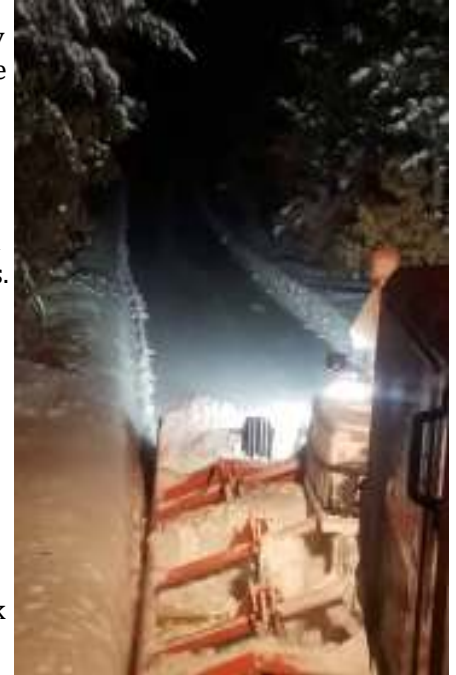
Photo credits: Night Snow Groomer & February trail group - Scott Nestle. Day Snow Groomer – Ricky Esckelson

http://www.facebook.com/pages/Saint-Helen-Snowpackers-Club/16902555977692